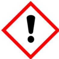
Irritant (Eye and Skin)