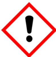
Irritant (Eye and Skin)